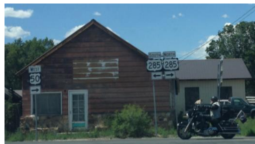
2 nd sign on US 50 before intersection with US 285, No sign at T-intersection w/ US 285