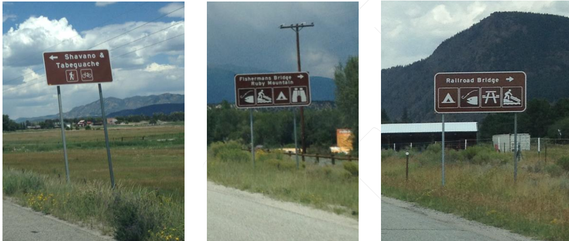
Recreation signs using iconography to minimize signage

The Colorado Department of Transportation (CDOT) is ultimately responsible for signage along the Collegiate Peaks Byway but federal, state, and municipal entities have also contributed signage.