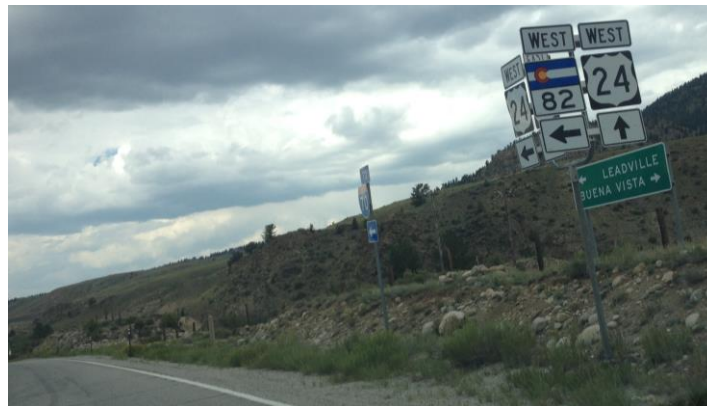
No sign directing travelers towards Byway from eastbound CO 82