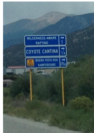
Consolidated business signage minimizes sign clutter with the exception of Santa