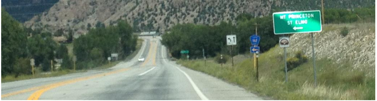
Signage for Mt. Princeton and St. Elmo without any indication of hot springs or ghost town