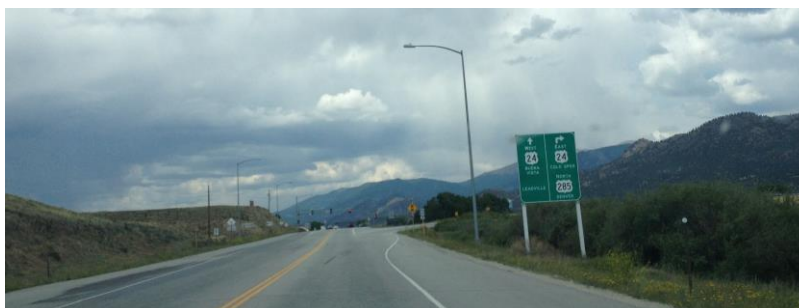
No sign at US 285 and US 24 intersection