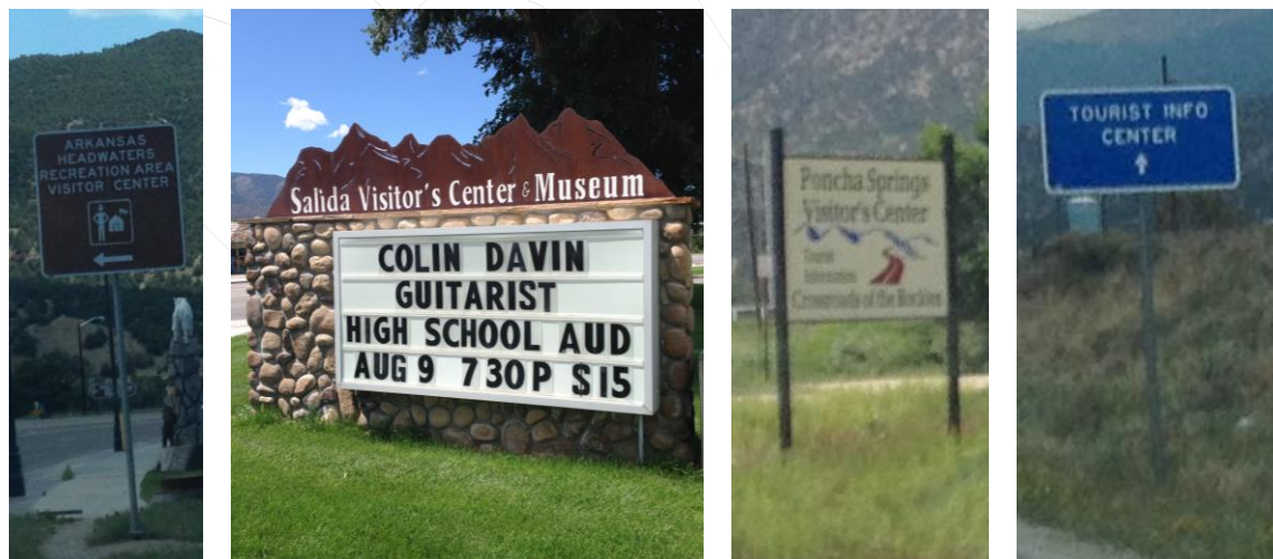
Inconsistent visitor center signage