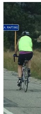
Bicycle signage and cyclists on Byway Buena Vista and Granite