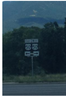
1 st sign on CO 291 before intersection w/ US 50, No sign at T-intersection w/ US 50