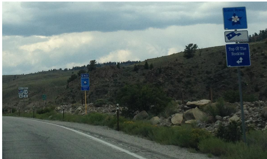
5 th and final sign just before intersection with CO 82