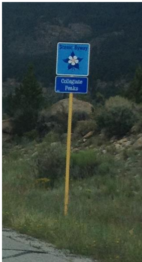
4 th sign south of Granite