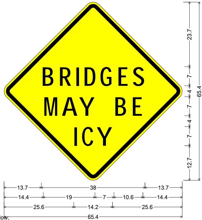
48.0" across sides 3.0" Radius, 1.3" Border, 0.8" Indent, Black on Yellow; "BRIDGES" D; "MAY BE" D; "ICY" D;