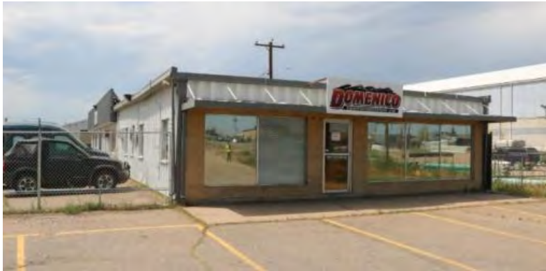
Figure 1. Photo of 5AM.4046 main building view northwest, courtesy Mead & Hunt 2019.

these buildings and Joseph Pepper over the other properties owned by the Pepper Company even if Joseph Pepper were found to be significant in our past.