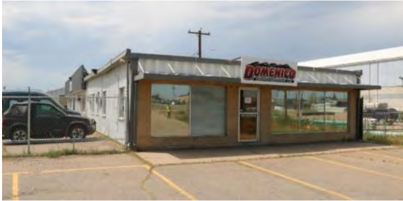
Figure 1. Photo of 5AM.4046 main building view northwest