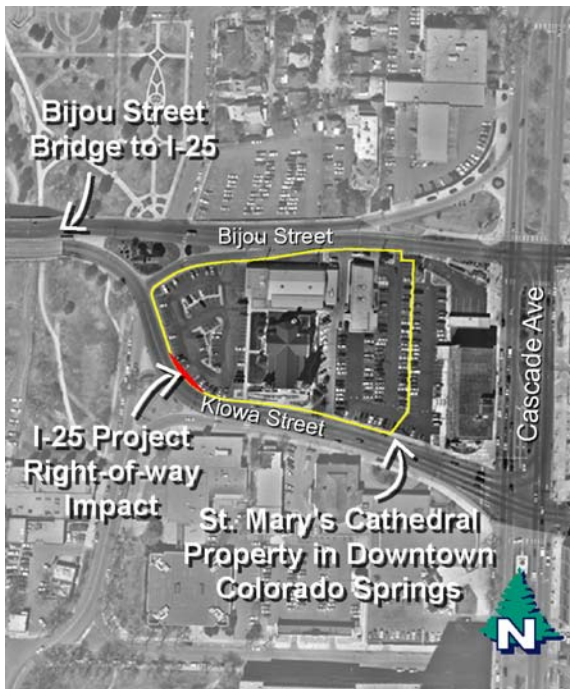
FIGURE 9-11 St. Mary's Cathedral Right-of-Way Impact

St. Mary's Cathedral (formerly called St. Mary's Church), at 26 West Kiowa Street, is located east of the I-25/Bijou Interchange (Exit 142), just across the street from the Monument Valley Park Entrance Gate. This church was completed in 1898 and listed on the NRHP in 1982, based on Criterion (c), for its neo-Gothic design and its architectural presence in downtown Colorado Springs. With the establishment of the Colorado Springs Catholic Diocese in 1984, the building was subsequently renamed St. Mary's Cathedral. This site has been designated as resource number 5EP208 by the Colorado State Historic Preservation Officer.