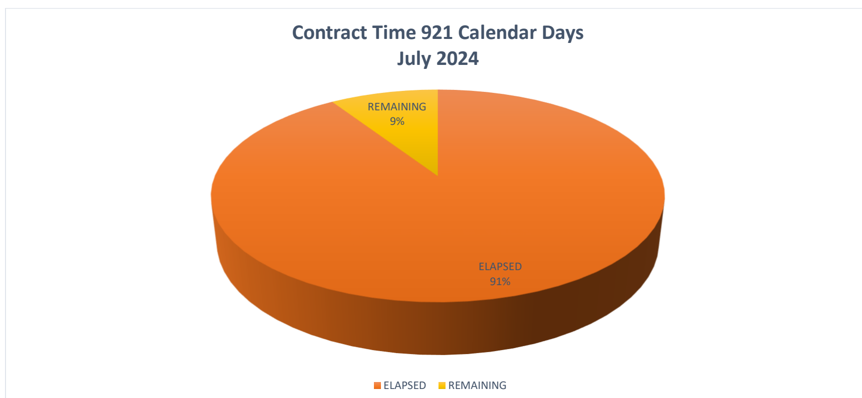
Figure 4: The percentage of time remaining on the contract out of 921 calendar days. 9% of contract time remains on the project as of July 2024.