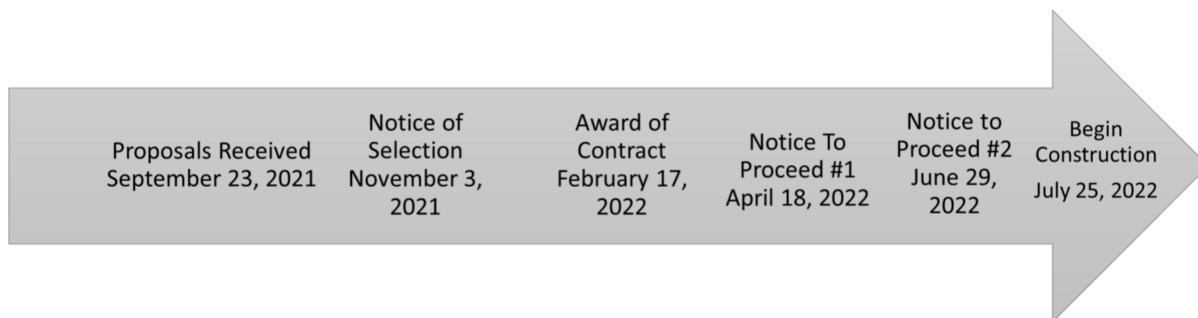
Figure 1: Project timeline showing major project milestones. The timeline starts at proposals received on September 23, 2021 and currently extends to the beginning of construction on July 25, 2022.