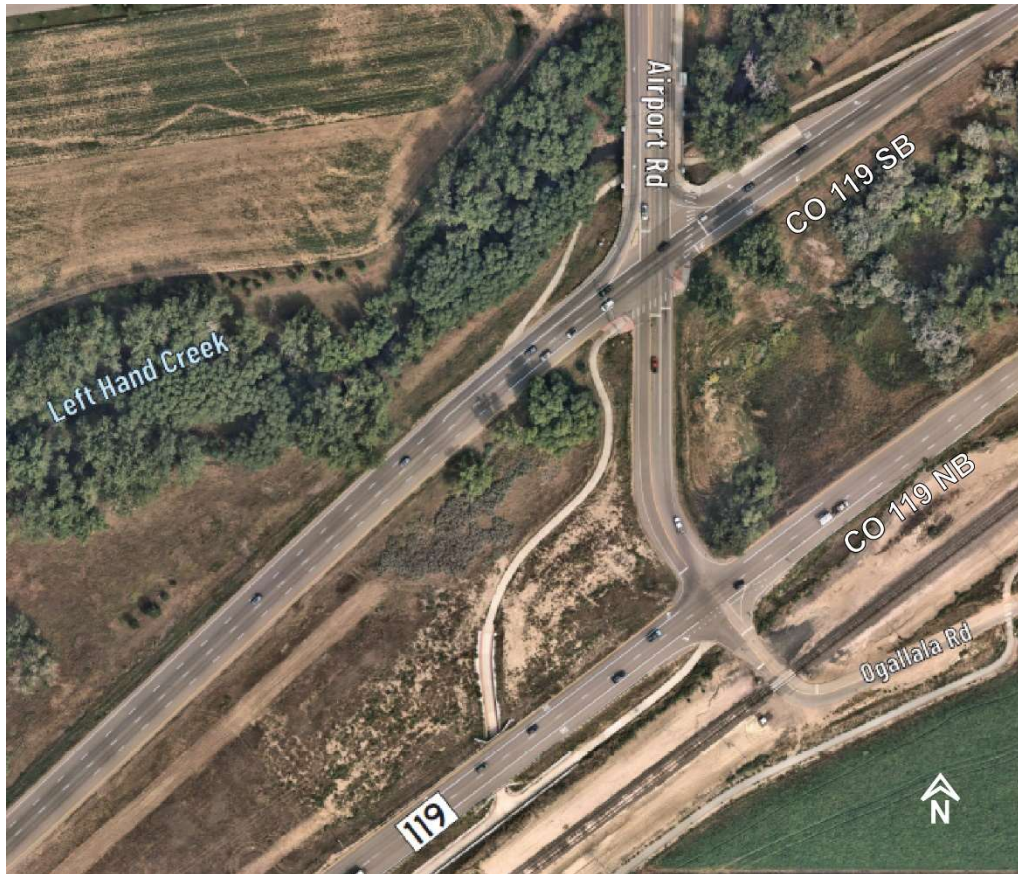
Figure 1. Intersection of CO 119 & Airport Rd/ Ogallala Rd

In December 2021, Boulder County brought forward a concept to the CO 119 Mobility and Safety Project Leadership Team that would eliminate the need to signalize the northbound CO 119 and Airport Road intersection, while potentially offering vehicular, transit, and bike and pedestrian operational and safety benefits, when compared to the option to signalize the northbound CO 119 and Airport Road intersection.