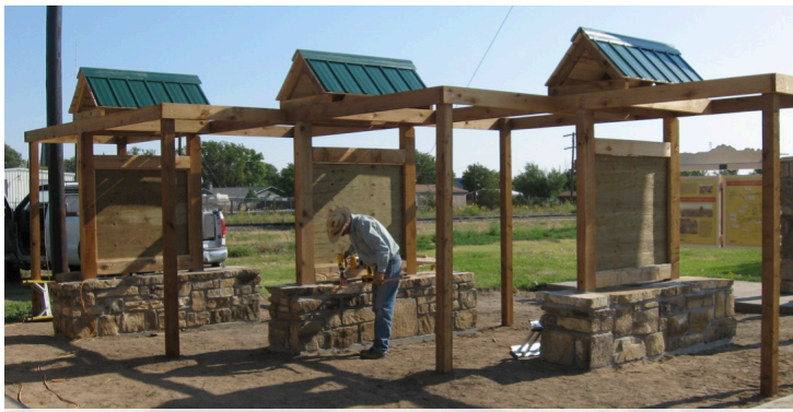
Example amenity site with three interpretive sign panels, shown under construction.