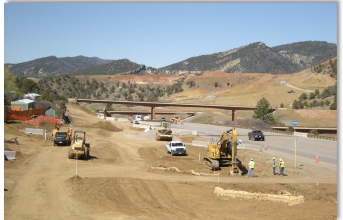
US 160 Grandview Interchange Phase III, the final phase, includes construction of a frontage road on the south side.

In 2009 on peak travel days, an average of 27,875 vehicles traveled this stretch of US 160 through Grandview. Traffic projections show that by 2030, 44,478 vehicles will travel US 160 on peak travel days near the interchange. When the traffic from the adopted Grandview Area Plan is added, this number grows to 85,910 vehicles per day in 2030 during peak season travel (these numbers are conservative, and consider the current economic downturn).