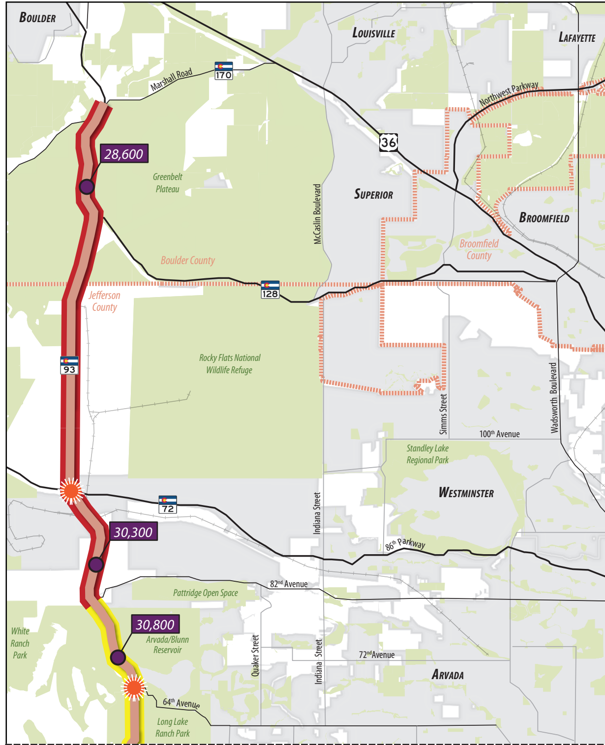
2040 - without Jefferson Parkway