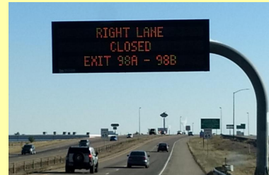
Boards warn motorists of lane closures and other information on the I-25/Ilex project.

These include evaluating corridor conditions through data analysis and field observations to determine appropriate operational control measures, and collaborating with stakeholders, among others.