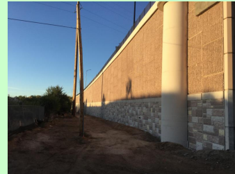
Before painting and staining

Much of the aesthetic treatment is done by hand to ensure a realistic appearance, which takes approximately two hours to complete 50 square feet of treatment area.