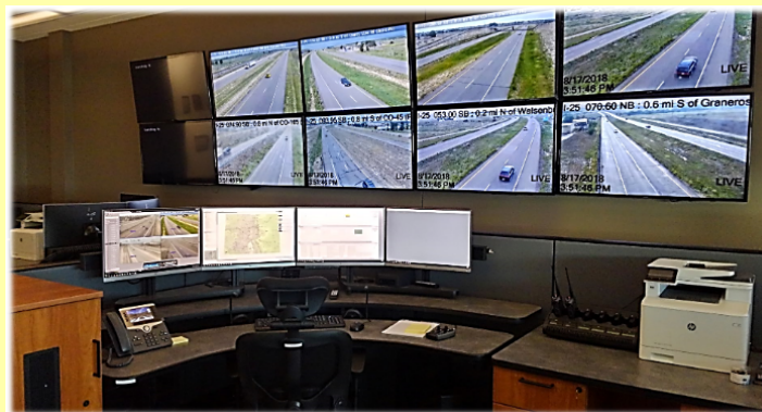
A view inside the Traffic Operations Center