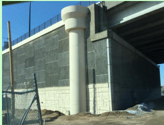
Before painting and staining