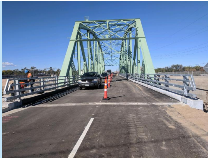
Green Truss Bridge - Traffic Shift - October 2018