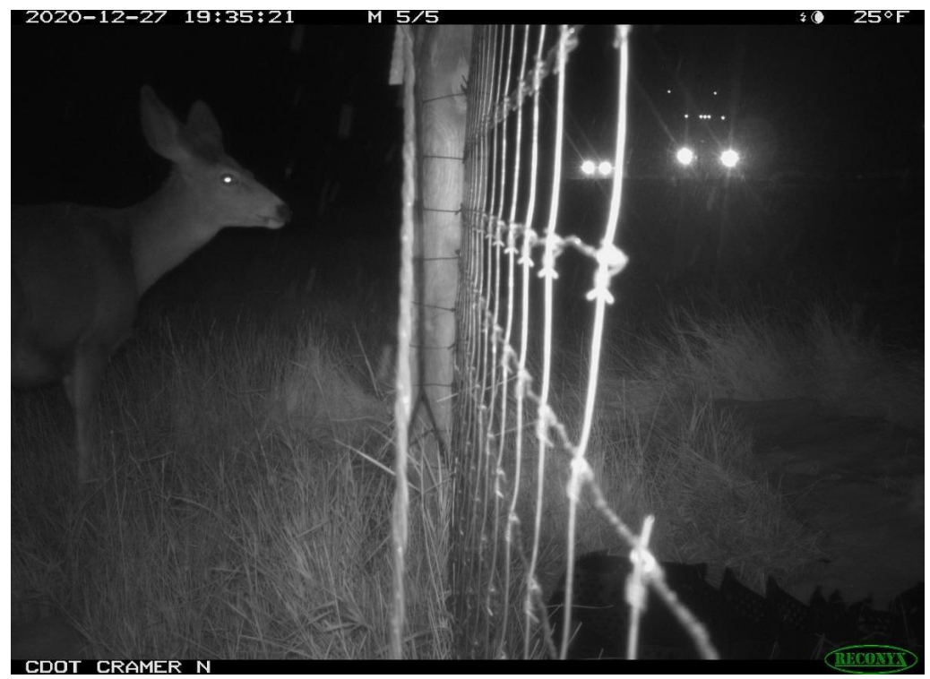
Mule deer success movement over US 160 at the EnviroGrid® Geocell treatment, north fenceend camera, non-interactive movement.