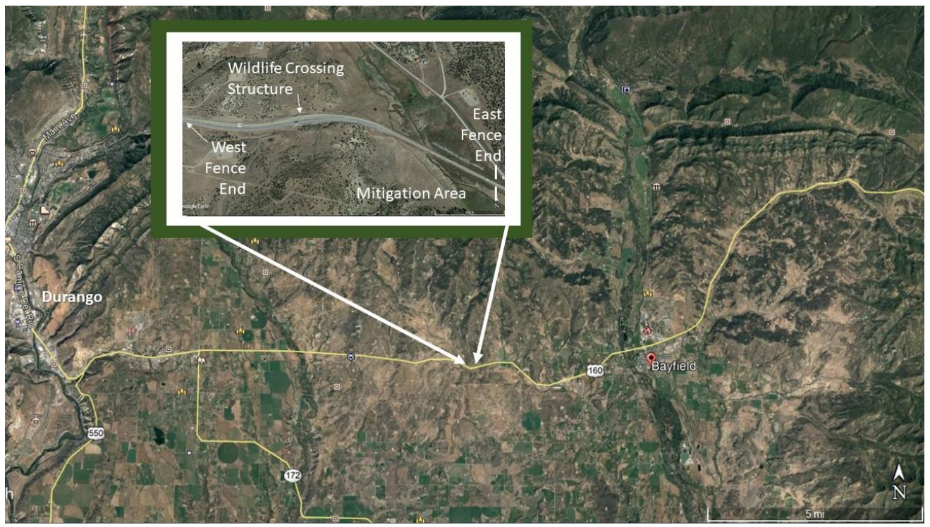
Figure 2. Study Area Map, East of Durango, and West of Bayfield Colorado on US 160.

The wildlife crossing structure was an underpass, and consisted of two concrete arches, each 13 feet high by 39 feet wide. The north arch was approximately 70 feet long and the south arch was approximately 52 feet long. The median opening between the arches was approximately 13 feet long (Figure 3). Total length was approximately 135 feet.