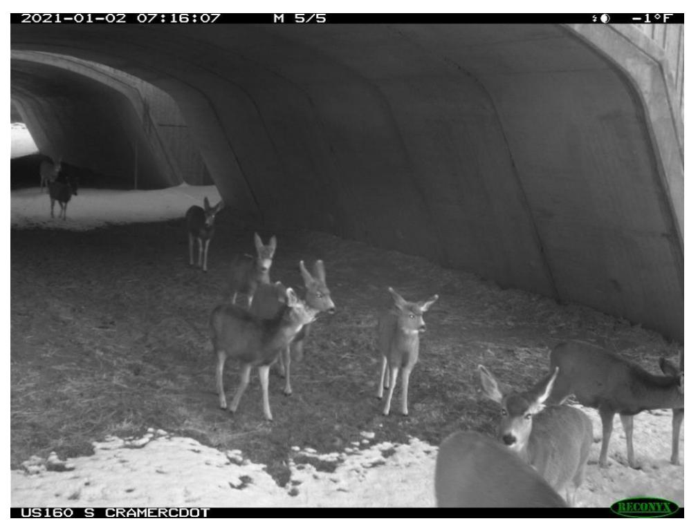
Mule Deer success movements through the wildlife crossing structure.