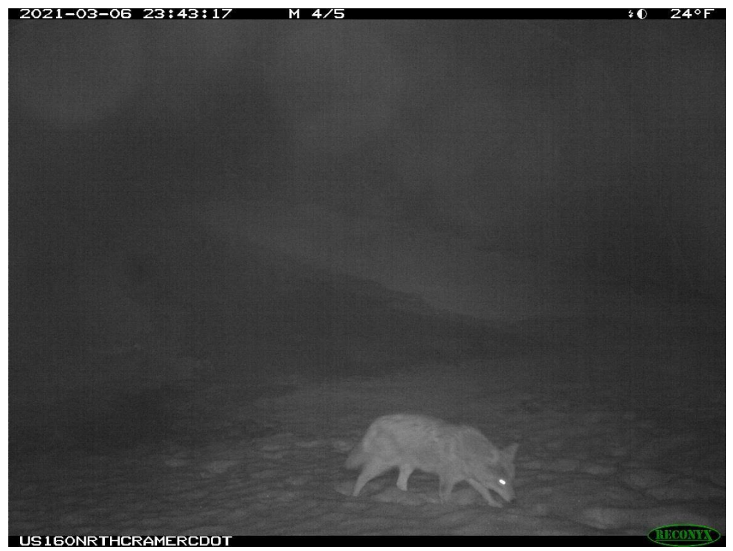
Coyote success movement through the wildlife crossing structure.