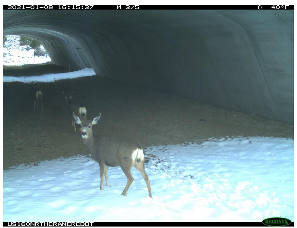
Mule Deer success movements through the wildlife crossing structure.