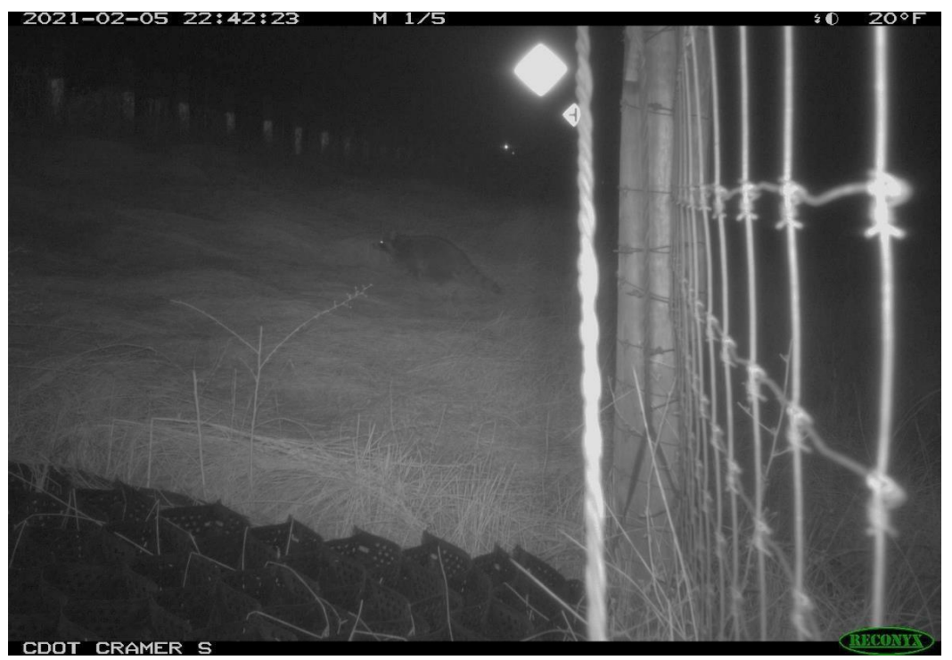
Raccoon success movement over US 160 at the EnviroGrid® Geocell treatment, south fence-end camera, non-interactive movement.