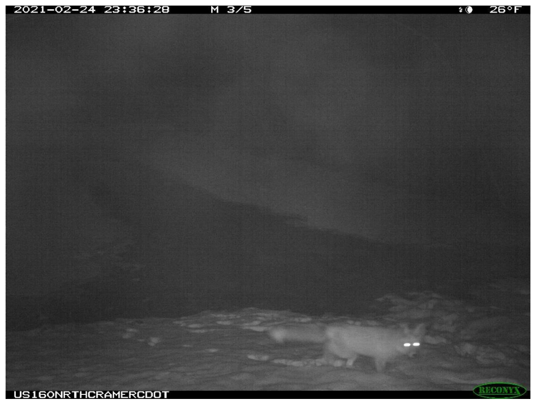
Red Fox success movement through the wildlife crossing structure.