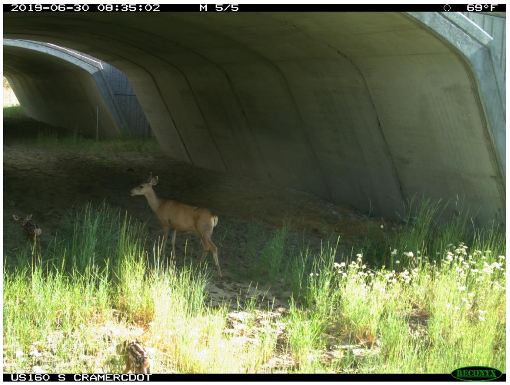
Mule Deer does brought fawns through the structure.