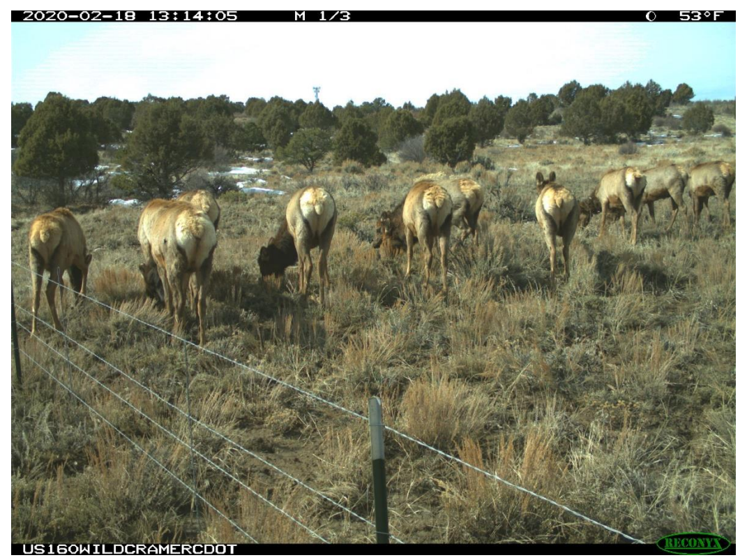
Herd of elk at wild camera, grazing outside of the right-of-way.