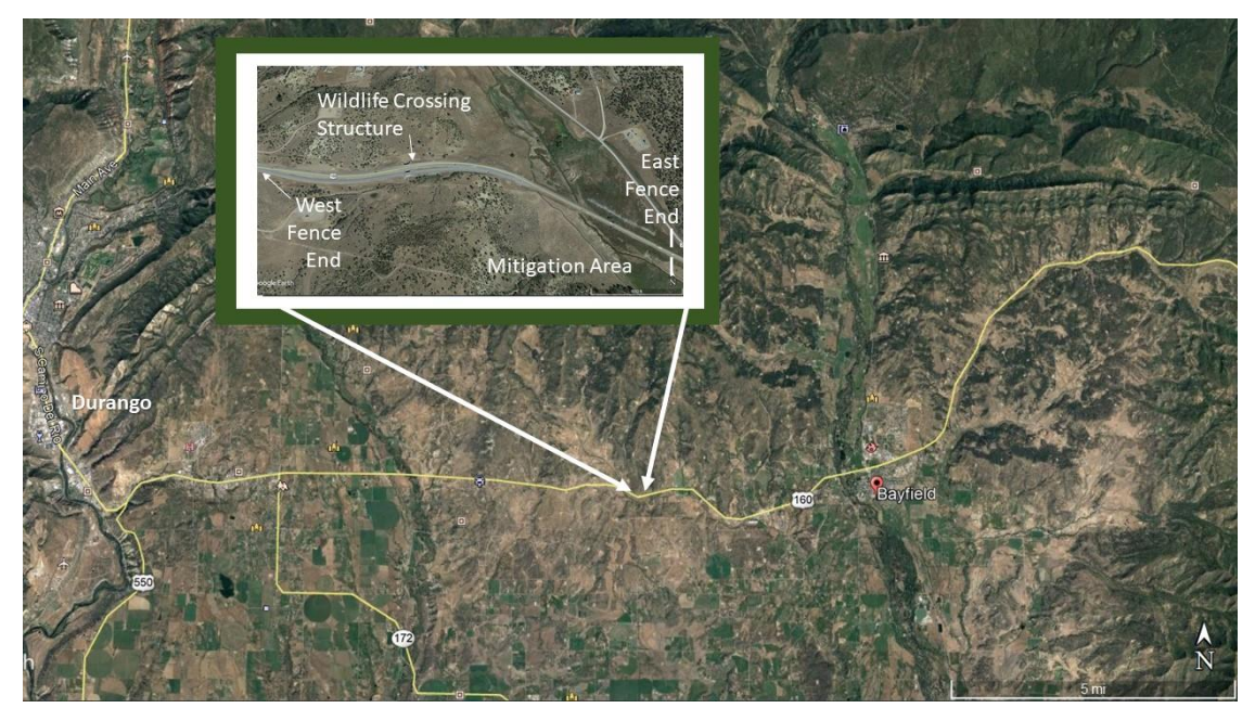
Figure 1. Study Area Map, East of Durango, and West of Bayfield Colorado on US 160.

The US 160 Dry Creek Wildlife Mitigation Project, located between Durango and Bayfield in southwest Colorado, was completed by the Colorado Department of Transportation (CDOT) in 2016. It included a wildlife crossing structure at mile post (MP) 97.42, wildlife exclusion fence on both sides of US 160 from MP 97.05 to MP 97.82, and two treatments placed to deter wildlife from moving into the fenced mitigation area rights-of-way at the east fence ends (Figure 1). The fence end treatments utilized EnviroGrid® Geocell, a cellular soil confinement system. The goals of the mitigation were to provide connectivity by allowing elk, mule deer, and other wildlife species to easily move under US 160, and to reduce wildlife-vehicle collisions (WVC). The primary objectives of this research were to quantitatively evaluate the effectiveness of the wildlife crossing structure and the EnviroGrid® Geocell treatments. An additional objective was to conduct a Before-After-Control-Impact (BACI) analysis of the changes in WVC reported crash rates between pre- and post-construction of the mitigation.