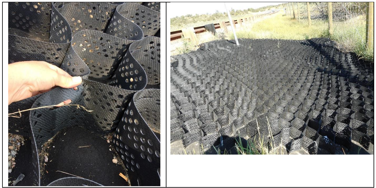
Figure 4. The EnviroGrid® Geocell Up Close (left), and In-Place at the East Fence End.