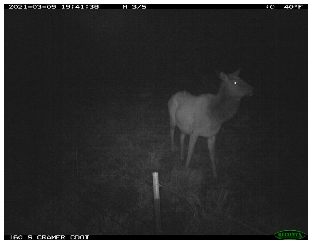
Elk at the wild camera.