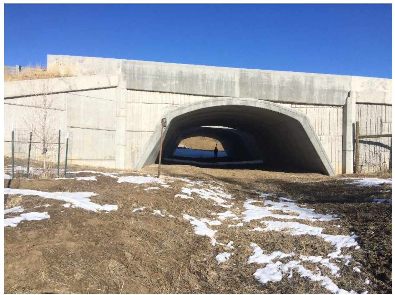
Figure 3. Monitored Wildlife Crossing Structure US 160 MP 97.42. The Monitoring Camera and Post at the South Entrance are in the Foreground. Cameras Faced the Entrances.

The EnviroGrid® Geocell was a flexible plastic material typically placed to prevent soil erosion. It was approximately six inches high, with leaf-shaped cells approximately eight inches by six inches (Figure 3). It was placed between the east fence end and the guard rail on both the north and south rights-of-way. The area of each treatment was approximately 10 feet by 30 feet.