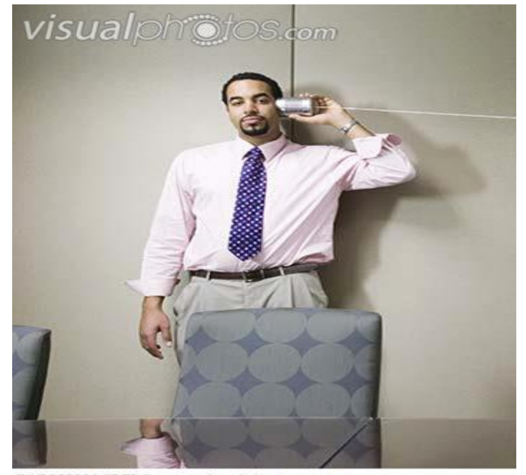
BLD008933 [RF] © www.visualphotos.com

Board of County Comm'rs v. Costilla County Conservancy Dist, 88 P.3d 1188, 1189 (Colo. 2004); Intermountain Rural Elec. Assn. v. Colo. PUC, 298 P.3d 1027 (Colo. App. 2012)