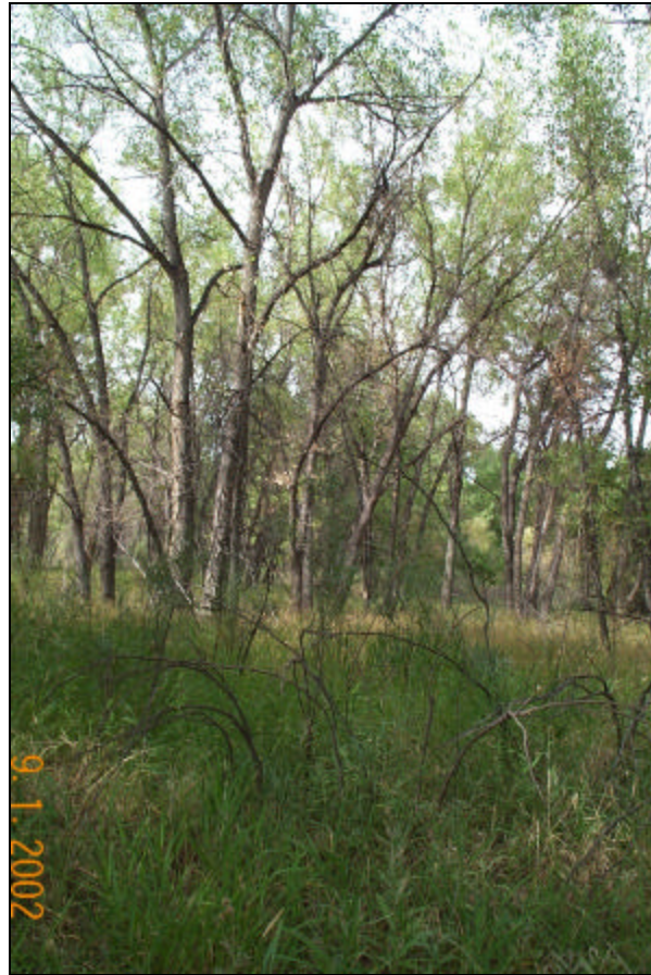
Photo 4. Dense stand of coyote willows on the east side of the forest