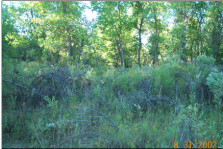
Photo 6. Dry channel of Cherry Creek with coyote willows.