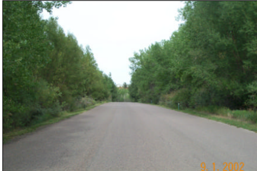
Photo 2. The eastern most channel of Cherry Creek north of the road.