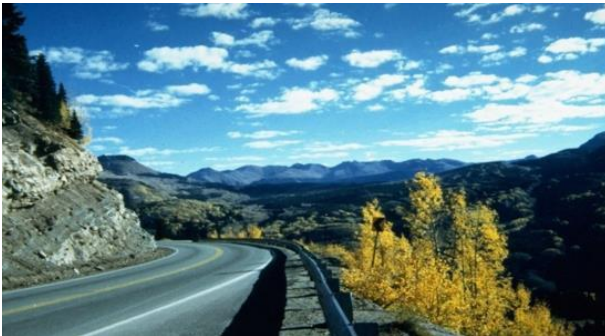
Region 5 Colorado's Famous "Million Dollar Highway" Part of the San Juan Scenic Skyway US 550

If improvements are considered personal property under state law, the tenant-owner may be reimbursed for moving them under the relocation assistance provisions. The real estate specialist will personally contact the tenant-owners of improvements to explain the procedures to be followed. Any payments must be in accordance with federal rules and any applicable state laws.