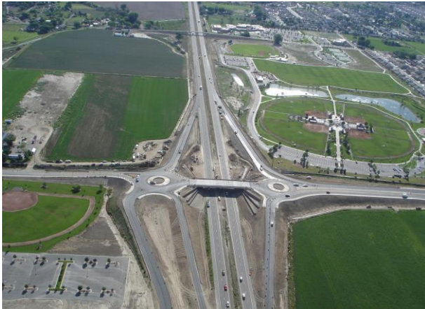
Region 3 I-70 at 24 Road Grand Junction. New bridge and two roundabouts

The valuation process used and the product produced when the Acquiring Agency determines that an appraisal is not required, pursuant to 49 CFR Part 24 § 24.102(c)(2) appraisal waiver provisions.