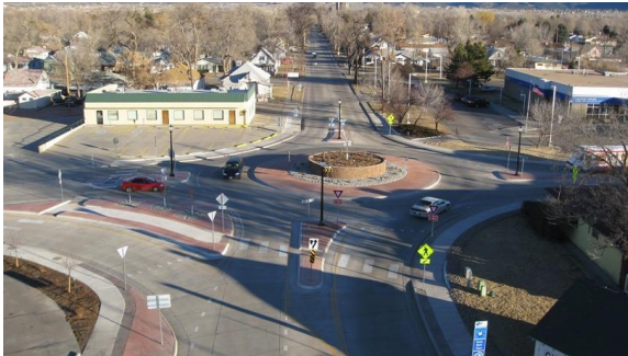
Region 2 Roundabout project in Canon City

https://www.codot.gov/business/designsupport/bulletins_manuals/row-manual.url/