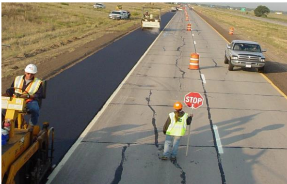
Region 4 Fort Morgan overlay project.

Mineral rights are interpreted to mean the “deep” mineral interests such as oil, natural gas or coal, not the surface mineral interests such as sand and gravel.